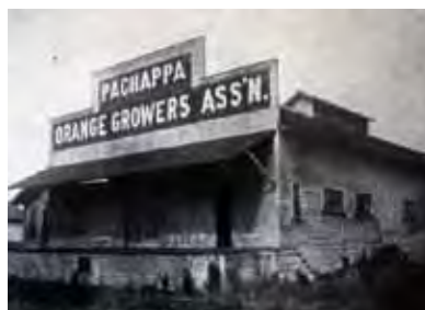
Pachappa Orange Growers Association, Riverside, California, origin of the CFGE, c1891.